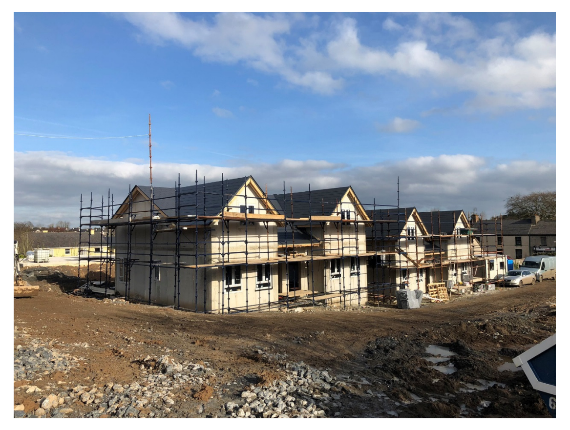
Photograph 1 – House numbers 1 - 4 incl. Roofing complete, internal fit out commenced. External wall insulation being installed.