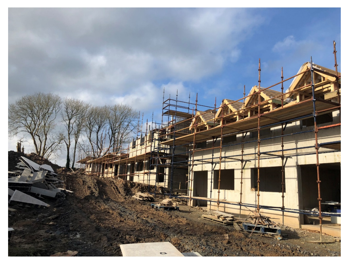
Photograph 3 – House numbers 9 – 16 incl. Roofing ongoing. Final phase of Sup-R-Wall being installed.