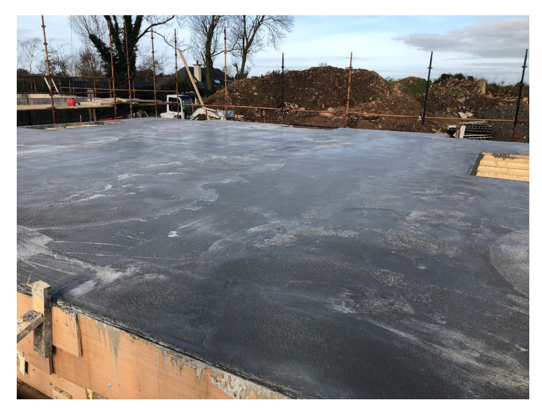
The following photographs show the external insulation being installed onto Sup-R-Wall;